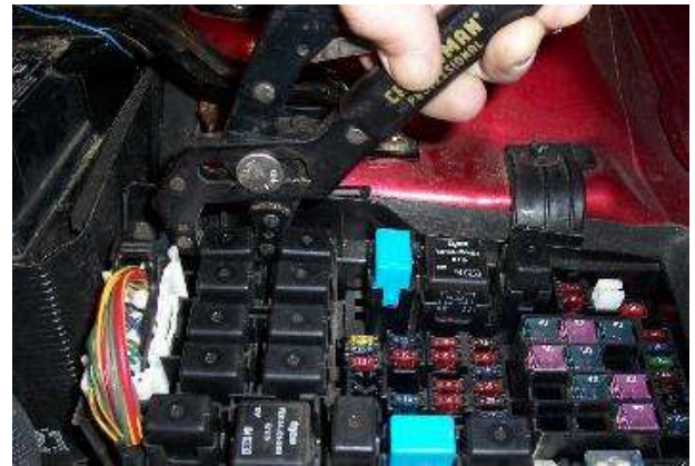
This is the relay to remove.

6. Remove the fuse panel cover and locate the primary fan relay within the fuse panel. This is the top relay in the 1st row of relays. It is designated as 'Fan Relay' on the diagram printed on the underside of the fuse panel cover. Carefully remove the primary fan relay.