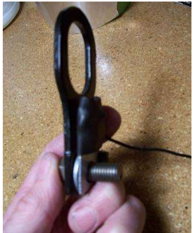
Bolt with engine hoist bracket and controller.

2. Position the provided washer and controller unit on the bolt in front of the engine hoist bracket as shown. Make sure the flat side of the controller is facing the washer and engine hoist bracket.