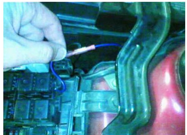
Replace the fan relay & connect the controller leads.

Note: If desired, the Auxilliary Fan Controller can be unplugged for faster cabin heat during winter.