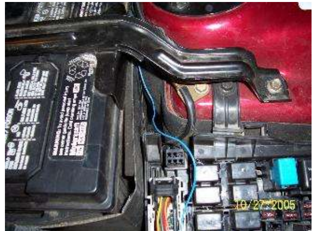
Wire routing around battery. (Blue wire shown.)

5. Bring the controller wire around the back of the battery and up towards the fuse panel.