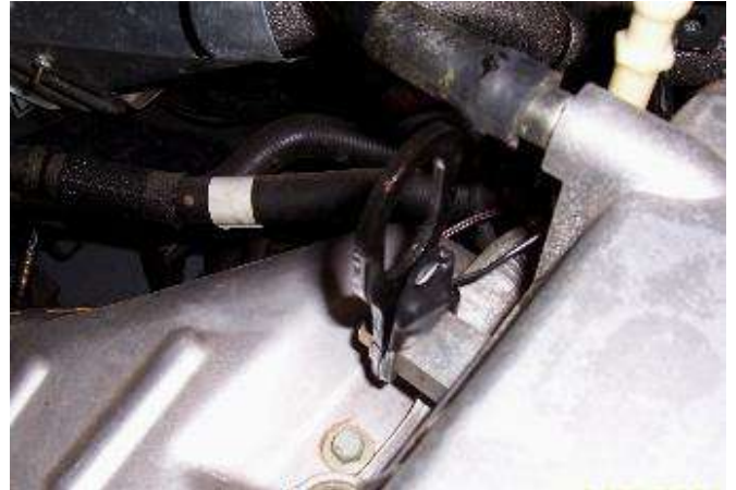
Controller mounted on the engine hoist bracket.

The Auxiliary Thermal Fan Controller provides an extra temperature sensor that enables the fan control relay when the engine temperature exceeds 180F. The sensor is mounted to the head using an existing accessory mounting bolt. As the head temperature reaches 180F, the radiator cooling fans are engaged to pull air through the radiator reducing the temperature of the engine coolant. This sensor does not interfere with fan control signals from the ECU so the fans will also run when commanded by the engine management computer.