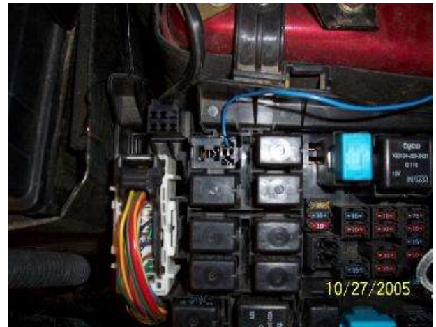
Connect the relay connector wire here.

8. Push the relay back into its socket to secure the wire in the socket contact. Connect the controller wire's plug into the relay connector wire's socket and route the wires out of the upper left corner of the fuse panel. Replace the cover on the fuse panel and the beauty cover on the engine and you're ready for a test drive!