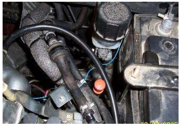
Wire routing. (Blue wire shown.)

4. Route the controller wire under the fuel lines and around the back of the battery. Be sure the wire does not have contact with the exhaust manifold.