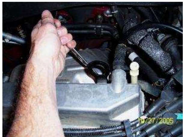
Remove the 13mm bolt on the engine hoist bracket.

1. First, remove the engine 'beauty cover' and set aside. Locate the engine hoist bracket mounted on the rear side of the cylinder head. Loosen and remove the bolt and engine hoist bracket using a 13mm wrench or socket and breaker bar. The bolt is very tight!